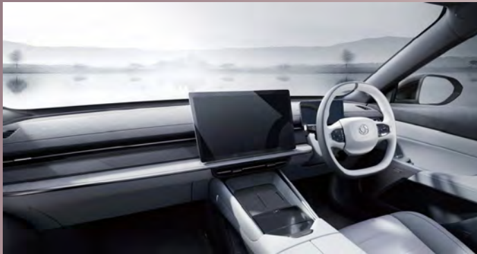
White & Grey AWD Performance