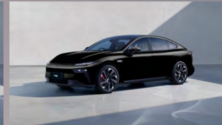
Metallic Night Shadow Black Optional ($499)