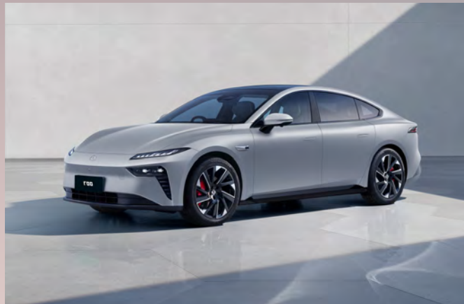
Metallic Sun Gold Optional ($499)