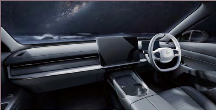
Grey & Black RWD Long Range