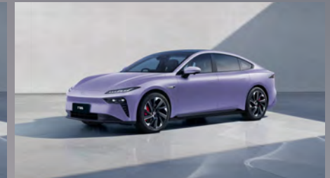
Metallic Orchid Purple Optional ($499)