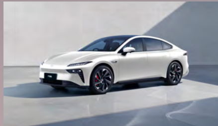
Metallic Morning White Standard