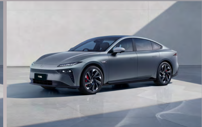
Metallic Stone Grey Optional ($499)