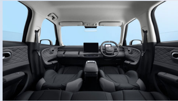
Grey & Black Standard