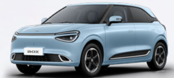
Icy Blue $499