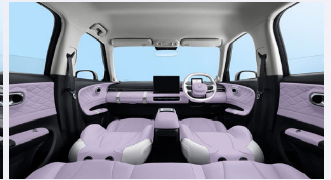
Purple & White Free Option