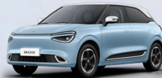
Icy Blue + Stone White Roof $749