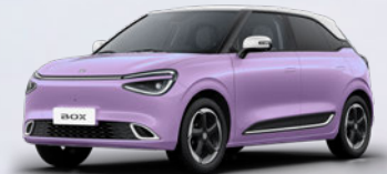
Aurora Purple + Stone White Roof $749