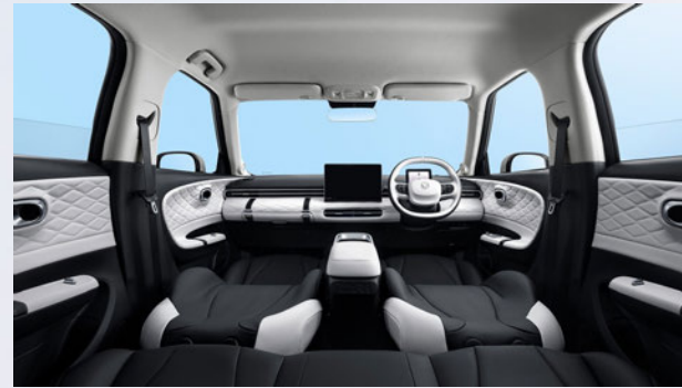
White & Black Free Option