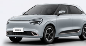
Glacial Silver $499