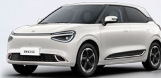
Metallic Twilight White Free Option