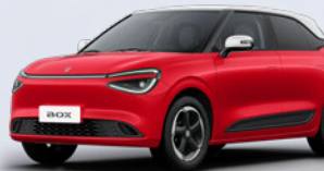
Metropolitan Red + Stone White Roof $749