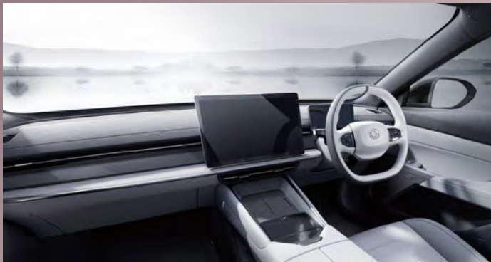
White & Grey AWD Performance